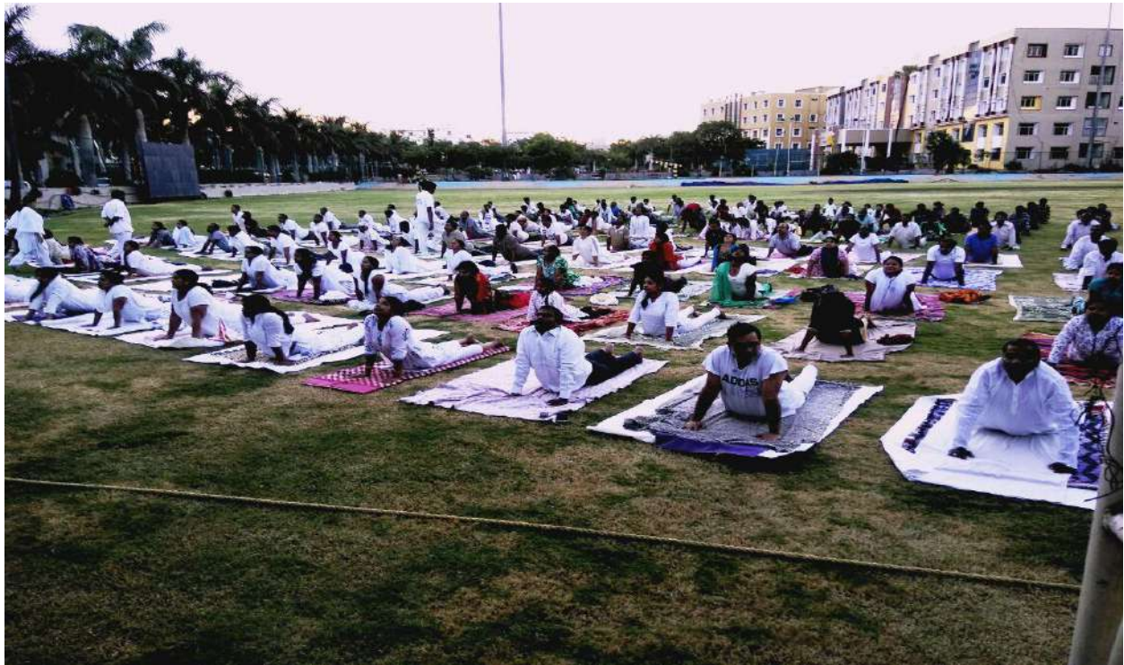
International Yoga Day organized on 21 st June 2018 in our College Cricket Ground