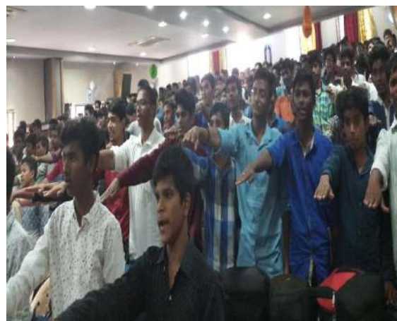
Chief guests & Students taking Oath